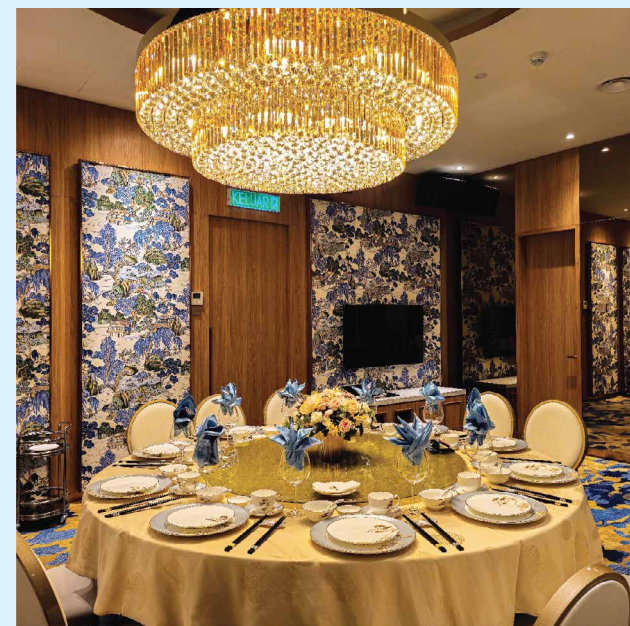
VIP Room 贵宾室