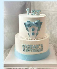
Cake 精美蛋糕 (原价RM450)

Minimum Spend RM13800 or above receive a complimentary backdrop