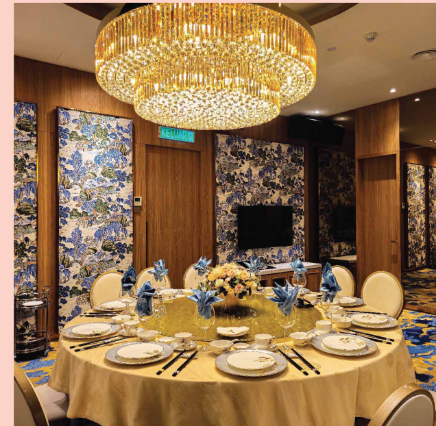
VIP Room 贵宾室