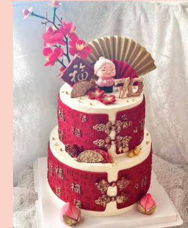
Cake 精致贺寿蛋糕 (原价RM580)

Minimum Spend RM1380 or above receive a complimentary backdrop